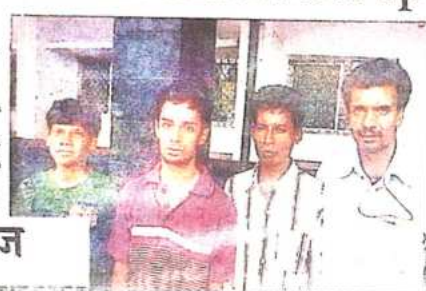
For Special Olympics Bharat has asked them to attend the final training camp in Delhi in January-February.