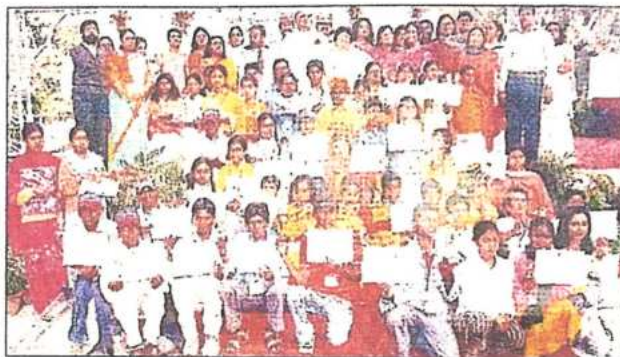
कौमी एकता बाल शिविर के समापन समारोह में राज्यपाल के साथ पुरस्कृत बच्चे